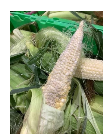
Poor cob filling.